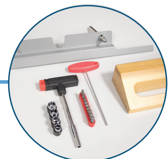
Blade Change Safety Tool Kit Change blades safely and easily, and make adjustments