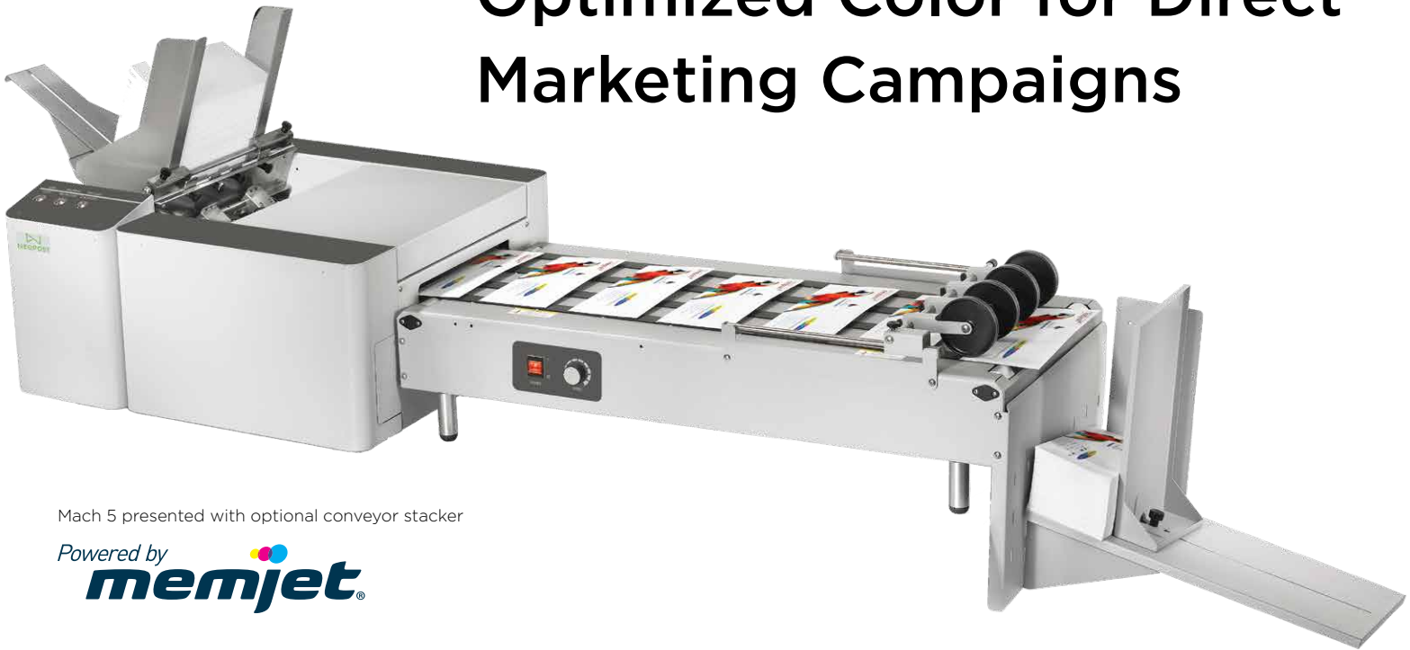
Mach 5 presented with optional conveyor stacker