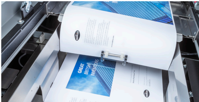
Collating station with the "tumbler" folding a sheet over to the station

Unique paper transport system with constant position monitoring ensures accurate and consistent paper handling. This ensures optimal sheet management and fold quality even with long sheets.