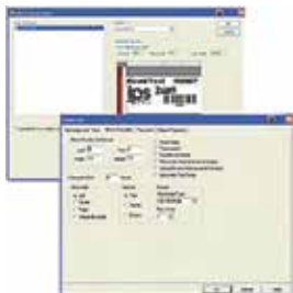
Design print template

The management software runs on the user interface and provides printer configuration, control and monitoring. The interface allows the user to monitor a wide variety of operating conditions, including job types, counts, and ink usage, all in real-time.