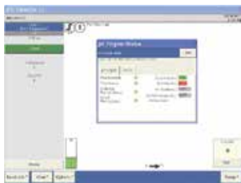
Manage and load jobs