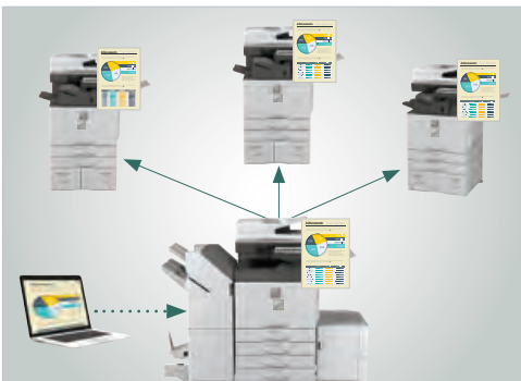
With Serverless Print Release you can securely print a job and release it from up to six Essentials Series models (including host).

The monochrome Essentials Series offer standard PCL 6 and optional Adobe PostScript 3 printing systems to help you speed through all of your output needs with accuracy. To help streamline your jobs, these powerful performers include Serverless Print Release , enabling you to securely print a job and release it from up to six Essentials Series models (including host) on your network. And with Google Cloud Print web printing service, you can print from Chromebook™ notebook computers, PCs and more from virtually anywhere.