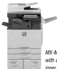
MX-M6050 shown with compact inner finisher.

When it’s time to get the job done, the Essentials Series monochrome document systems are outstanding performers. Quickly scan documents at speeds up to 80 images per minute . Then use the manual stapling feature on select finishers to restaple your originals. Multiple finishing options give you the output you require, be it stacked, stapled or saddle-stitched. There’s even an available built-in stapleless staple feature, which can bind up to five sheets of paper by adding a crimp to the corner of the set, saving regular staples for larger sets.