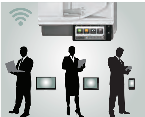
Available wireless network interface for convenient scanning and printing from mobile devices.

From paper handling to networking, the MX-M5050 and MX-M6050 monochrome Essentials Series will exceed your expectations.