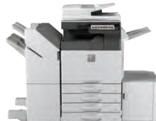
MX-M6050 shown with 3K saddle stitch finisher and large capacity cassette.