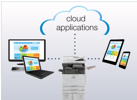
Distribute, access and print documents more easily.