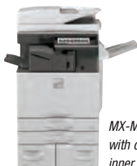
MX-M4070 shown with compact inner finisher.

When it's time to get the job done, the Advanced Series monochrome document systems are outstanding performers. Quickly scan documents at speeds up to 200 images per minute . Built-in optical character recognition (OCR) can convert your scanned documents into text-searchable PDFs or Microsoft Office file formats, simplifying your workflow. Use the manual stapling feature on select finishers to restaple your originals. Multiple finishing options give you the output you require, be it stacked, stapled or saddle-stitched. There's even an available built-in stapleless staple feature, which can bind up to five sheets of paper by adding a crimp to the corner of the set, saving regular staples for larger sets.