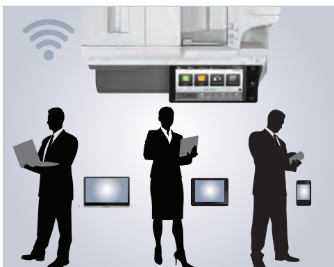
Built-in wireless network interface for convenient scanning and printing from mobile devices.

From paper handling to networking, the MX-M3070, MX-M3570 and MX-M4070 monochrome Advanced Series will exceed your expectations.