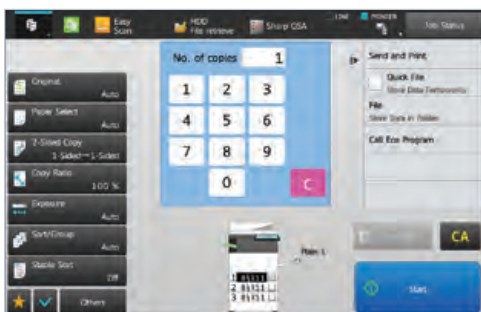
Standard Copy Screen offers more advanced features.