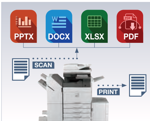
Scan and convert documents to popular file formats seamlessly with Sharp's built-in OCR function.