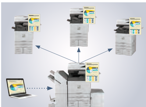
With Serverless Print Release you can securely print a job and release it from up to six Advanced Series models (including host).