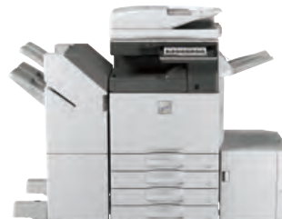
MX-M4070 shown with 3K saddle stitch finisher and large capacity cassette.