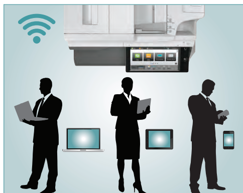
Available wireless network interface for convenient scanning and printing from mobile devices.

From paper handling to networking, the MX-3050N, MX-3550N, and MX-4050N color Essentials Series will exceed your expectations.