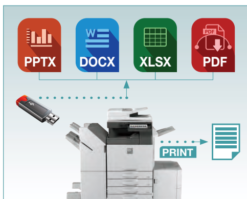
Direct print to popular file formats seamlessly with Sharp's available direct print expansion kit. 1