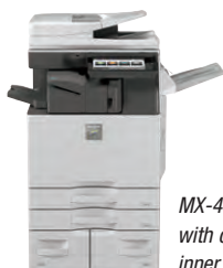
MX-4050N shown with compact inner finisher.

When it’s time to get the job done, the Essentials Series color document systems are outstanding performers. Quickly scan documents at speeds up to 80 images per minute . Then use the manual stapling feature on select finishers to restaple your originals. Multiple finishing options give you the output you require, be it stacked, stapled, or saddle-stitched. There’s even an available built-in stapleless staple feature, which can bind up to five sheets of paper by adding a crimp to the corner of the set, saving regular staples for larger sets.