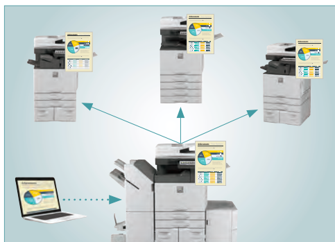
With Serverless Print Release technology you can securely print a job and release it from any of five color Essentials Series models.