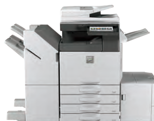
MX-4050N shown with 3K saddle stitch finisher and large capacity cassette.