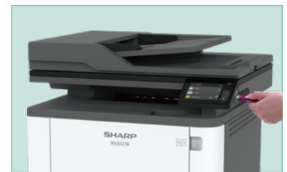
Front USB port for easy direct printing.