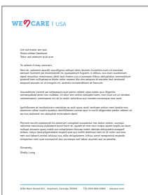
8.5" x 11" $.003 per copy / $3.05 per 1,000*