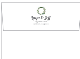
A7 Envelope $.0004 per copy / $.40 per 1,000*