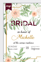
4" x 6" Postcard $.0039 per copy / $3.99 per 1,000*