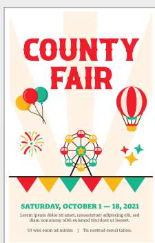
11" x 17" $.042 per copy / $42.30 per 1,000*