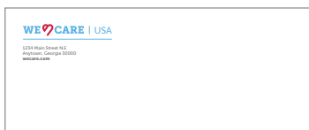
#10 Envelope $.0013 per copy / $1.30 per 1,000*

The FireJet 4C is a cost-effective system for printing a wide variety of products such as envelopes, postcards, flyers, and posters.