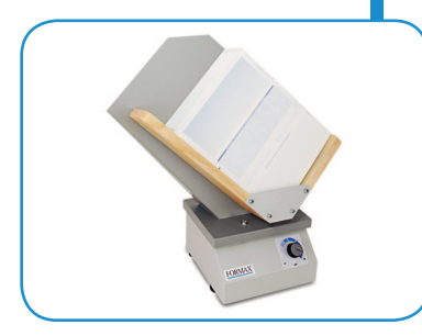
402 Series Jogger - an option which reduces static electricity from forms and aligns them for proper feeding