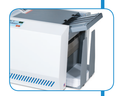
Standard Catch Tray