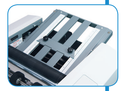
Clearly marked fold plates are easy to adjust