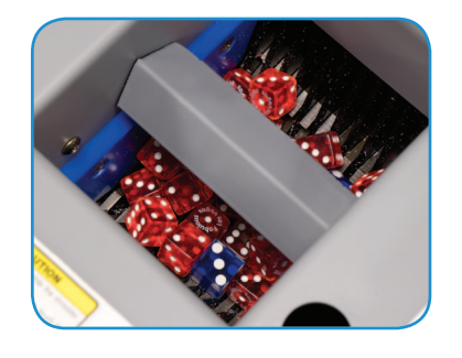
Solid steel blades shred chips, tokens, dice, cards