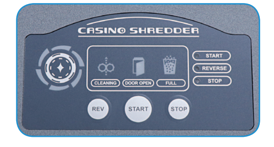
User friendly LED control panel displays real-time shredding status