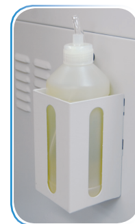
EvenFlow™ Automatic Oiling System

*Capacity varies depending on paper and power supply