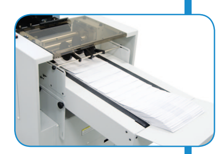
24" outfeed conveyor helps keep forms in a neat order after processing