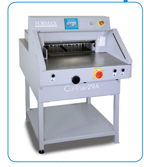
Standard model, without optional wide side tables

Formax - New Hampshire, USA www.formax.com