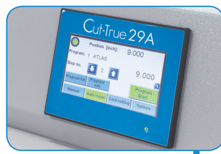
Full-color touchscreen control panel allows for programming up to 100 jobs